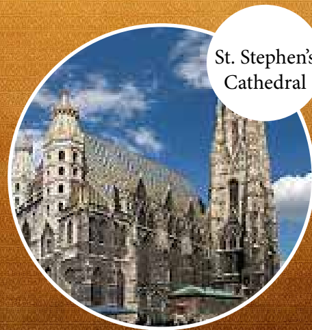
St. Stephen's Cathedral