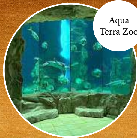
Aqua Terra Zoo