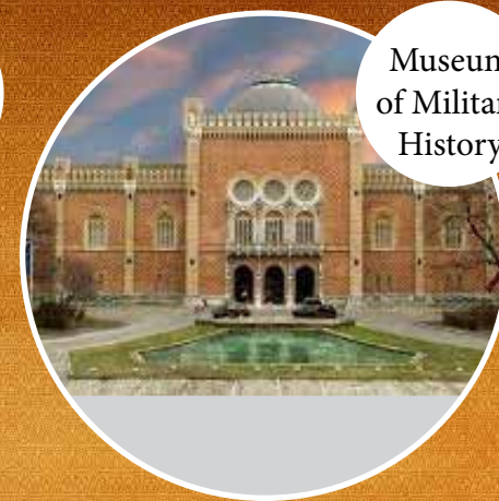
Museum of Military History