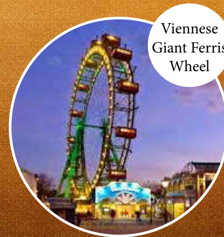
Viennese Giant Ferris Wheel

Theme: "Learn more about COPD to overcome the obstacle: Breathe better, Live more"