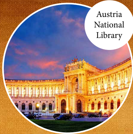
Austria National Library